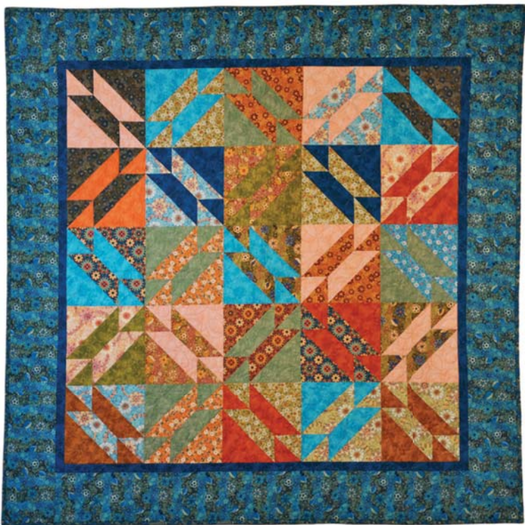
Quilt Size: 58" x 58" Block Size: 9" (25 block quilt)